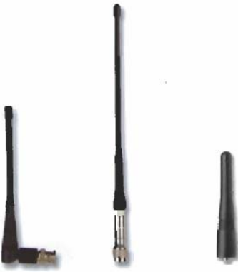
JRU04 JRU05 JRU06