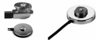
Screw (NMO/G/GM /SM/T type) & Magnetic Mount