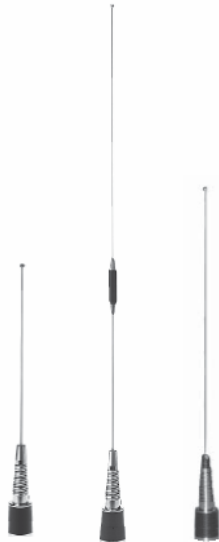
Quarter Wave / Collinear VHF/UHF antenna