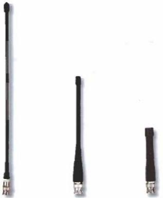
JRL10 JRU02 JRU03