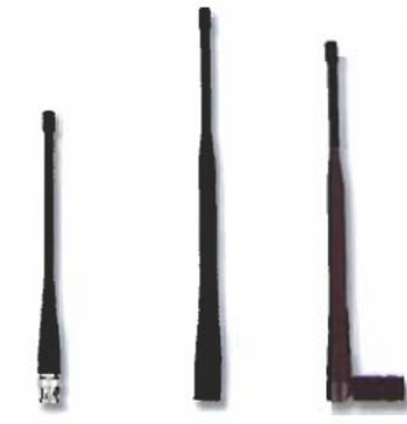
JRS01 JRS02 JRS03