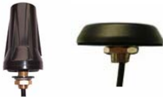
Low Profile 380Mhz ~ 960Mhz and 1710 ~ 2500 dual Band Antenna