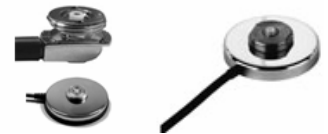
Screw (NMO/G/GM /SM/T type) & Magnetic Mount