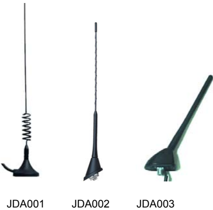
JDA001 JDA002 JDA003