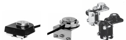
Truck Lid Mount & Glass Mount