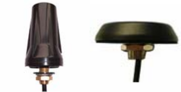
Low Profile 380Mhz ~ 960Mhz and 1710 ~ 2500 dual Band Antenna