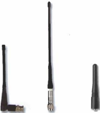
JRU04 JRU05 JRU06